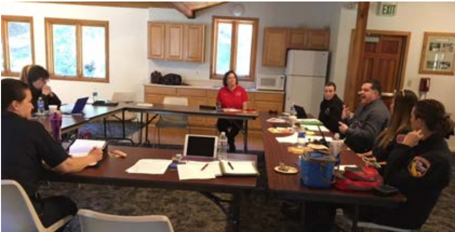
Public Education Committee

February 10, 2015—hosted by Monrovia Fire in a rustic cabin where the Consumer Product Safety Commission (CPSC) discussed some of its educational topics.