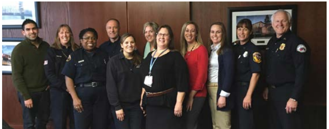
Public Education Committee - Napa Meeting

Presentations were also made by Committee members including the Firefighters Burn Institute Youth Firesetters Program, a presentation on social media, San Ramon Valley Fire's residential care facility education program, and the Alisa Ann Ruch Burn Foundation Firefighters in Safety Education program.