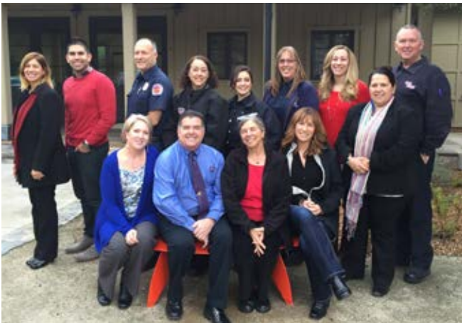
Public Education Committee

In 2015, the Committee chose to change meeting locations to be rotated among Committee members. Meetings were hosted by The Department of Forestry and Fire Protection (CAL FIRE) Napa Unit/Napa Fire, Moraga-Orinda Fire District, Firefighters Burn Institute, San Ramon Valley Fire, Central County Fire, and Livermore-Pleasanton Fire. Attendance at our meetings has varied with between five and 10 Committee members attending regularly. The Committee enjoyed participation from partners beyond the fire service this year, including hospitals and burn foundations.